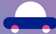
Car Benefit Policies