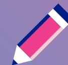
The Design of Work