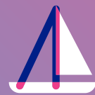
Vacation and Other Leave Policies