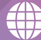
Global Pay Summary