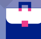
Severance Pay Policies