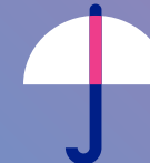
Worldwide Benefit & Employment Guidelines