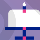
Global Parental Leave