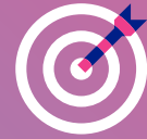
Incentives Around the World